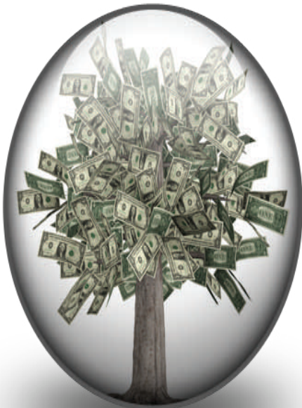
Personal Money Tree

Since it's time to begin a new year—this is the time to plan on how to handle your funds in 2011 without the luxury of a money tree. Start by reviewing the following: